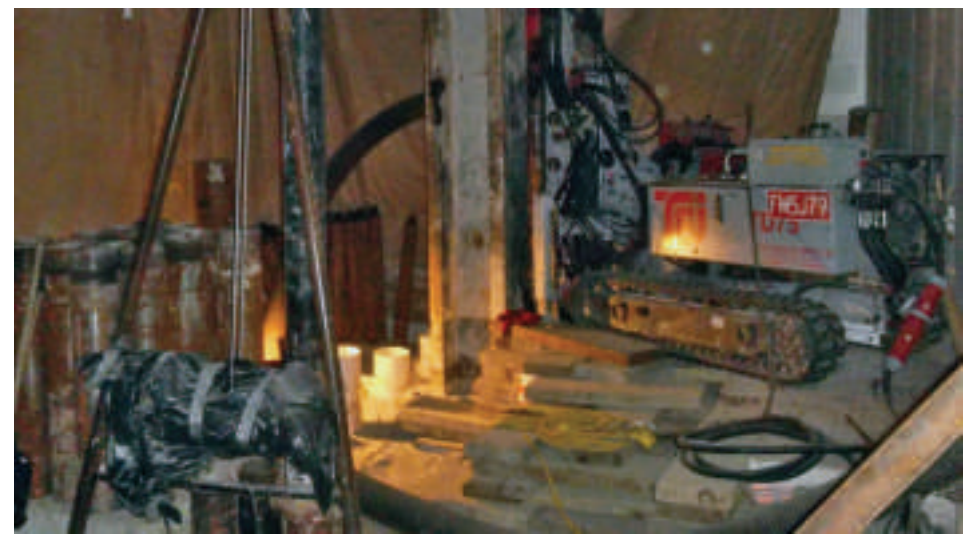
In the enclosed work area, the TEI TD75 is in drilling position on a difficult access hole

spoil removal and equipment access; all below and through an operational hospital.