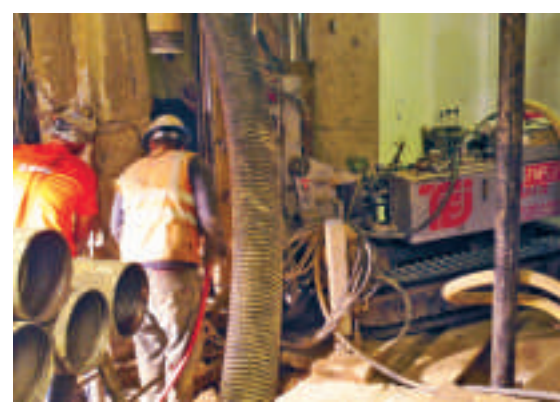
Workers inspect a micropile excavation. Vacuum is shown connected to the duplex swivel.

testing, we tested the micropiles in compression and tension, to the loads listed above. The testing was accomplished by placing a test beam over three adjacent production micropiles. The outer micropiles acted as reaction piles for testing of the center micropile. A custom hydraulic testing ram was fabricated out of aluminum by Richard Dudgeon, Inc. to reduce weight as no conventional hoisting equipment was usable inside the work spaces. All load testing resulted in acceptable results.